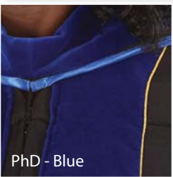
PhD - Blue