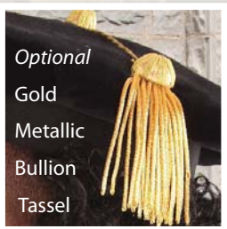
Optional Gold Metallic Bullion Tassel