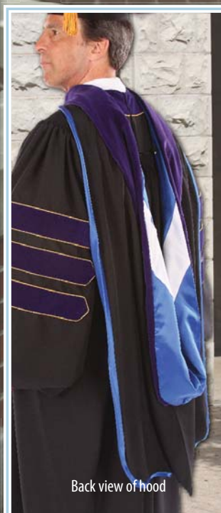
Back view of hood